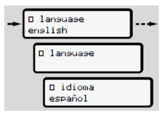
Fig. 1: Choosing the required language

3. The DTCO 4.0 displays the successful language storage in the newly selected language.